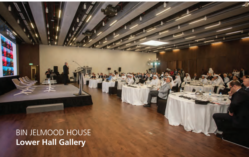
BIN JELMOOD HOUSE Lower Hall Gallery