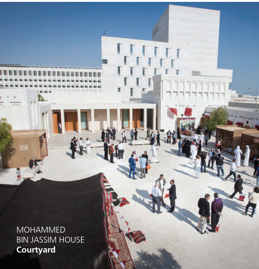
MOHAMMED BIN JASSIM HOUSE Courtyard

IT technical support and essential amenities are available