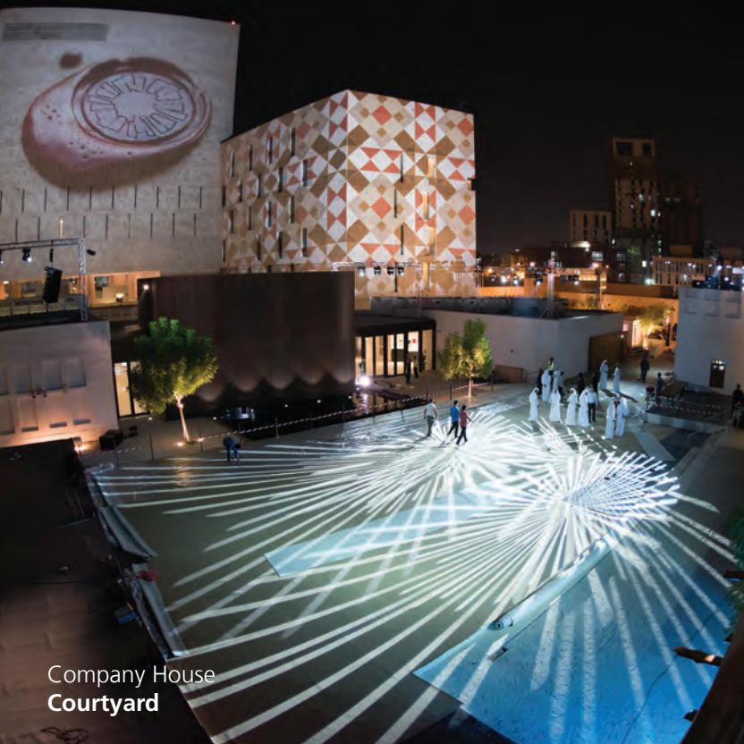
Company House Courtyard