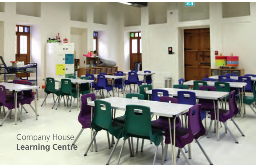
Company House Learning Centre