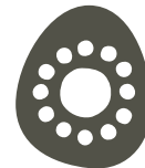
MOHAMMED BIN JASSIM HOUSE