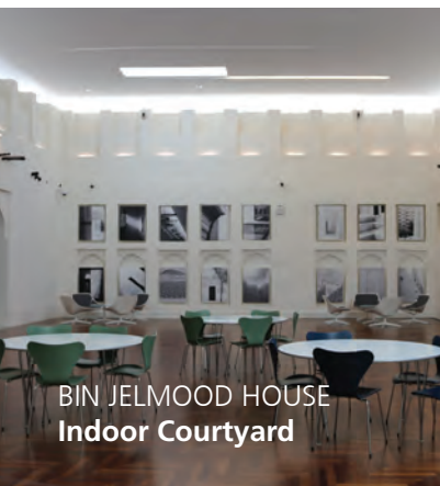
BIN JELMOOD HOUSE Indoor Courtyard