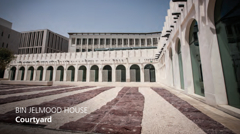
BIN JELMOOD HOUSE Courtyard