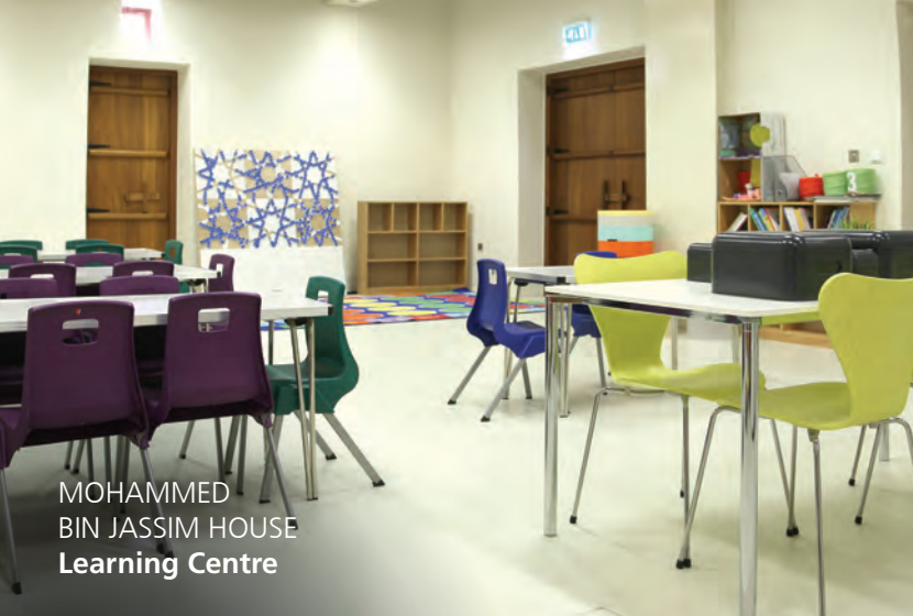
MOHAMMED BIN JASSIM HOUSE Learning Centre