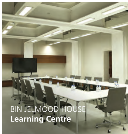
BIN JELMOOD HOUSE Learning Centre